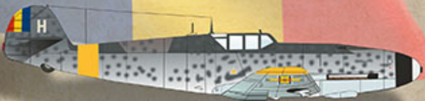
⑨ Bf 109G-2 of the 53th Fighter Squadron based at Mizil, not far from Ploesti zone. Summer 1943. Mickey is the insignia of 7th fighter Group.