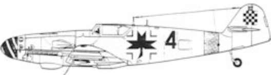
BF-109G-10, Black 4, Croatian Air Force, Northern Italy, 1945. Camouflaged in late war scheme of 81/82/76. Rudder, lower wingtips and band aft of spinner yellow. Yellow band on fuselage painted over, possibly in RLM 81. Spinner is striped black and white. Although fitted with a long tail wheel leg, the aircraft retains the G-6 type wheel bulges and narrow tires, as well as the early rudder without external trim tabs. These features could indicate that the aircraft is actually a G-14/AS.