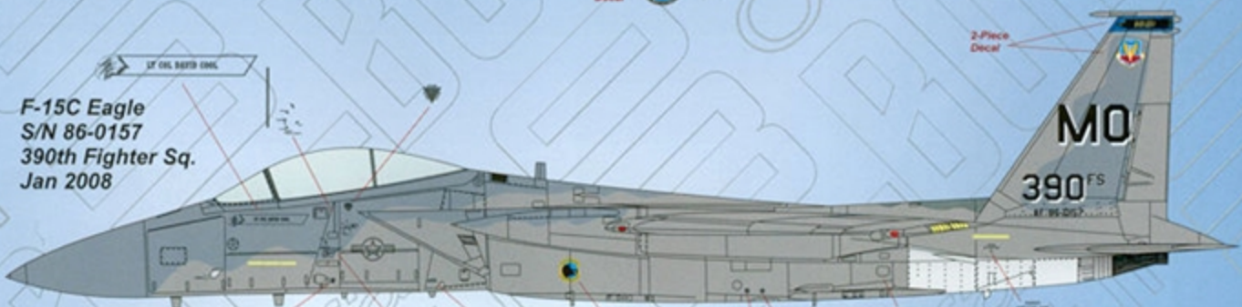
F-15C Eagle S/N 86-0157 390th Fighter Sq. Jan 2008