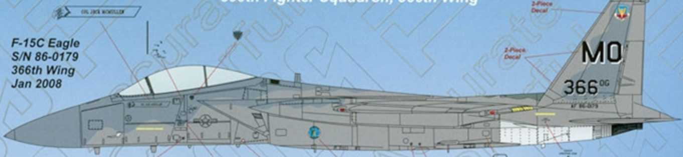
F-15C Eagle S/N 86-0179 366th Wing Jan 2008