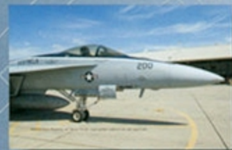
An F/A-18E Super Hornet assigned to the "Kestrels" of Strike Fighter Squadron One Three Seven (VFA-137) is raised to the flight deck by elevator from the hangar bay.