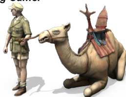
F48392 Afrikakorps Soldier Prodding Unwilling Camel