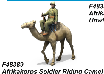
F48389 Afrikakorps Soldier Riding Camel