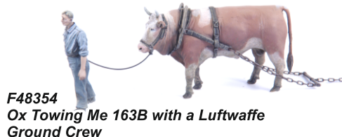
F48354 Ox Towing Me 163B with a Luftwaffe Ground Crew