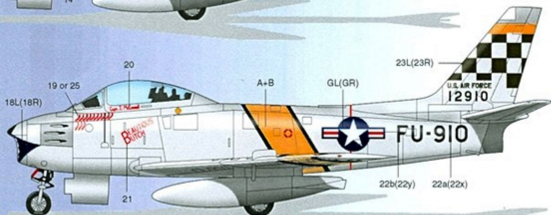
"BEAUTIOUS BUTCH" Captain Joseph McConnell F-86F-1 #51-2910. 39th. Fighter Interceptor Squadron, 51st. Fighter Interceptor Group. Suwon, 18 May 1953. 6-3 wing. The picture we have shows the score board as decal 25. However this half A/C is probably due to peeling off the original silohuet. Your choice!