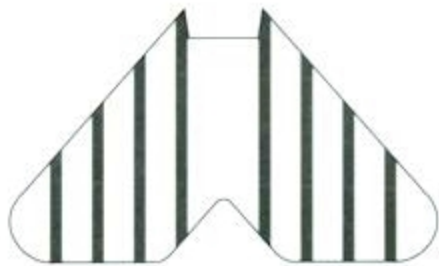
Scrap view of tail from Scheme A, 502 17