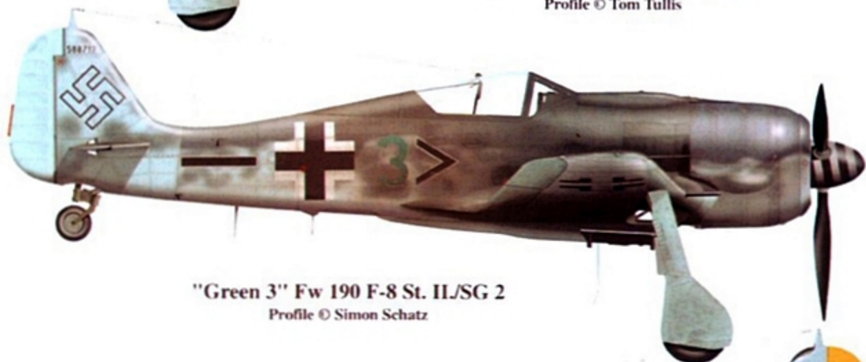
"Green 3" Fw 190 F-8 St. II/SG 2 Profile © Simon Schatz