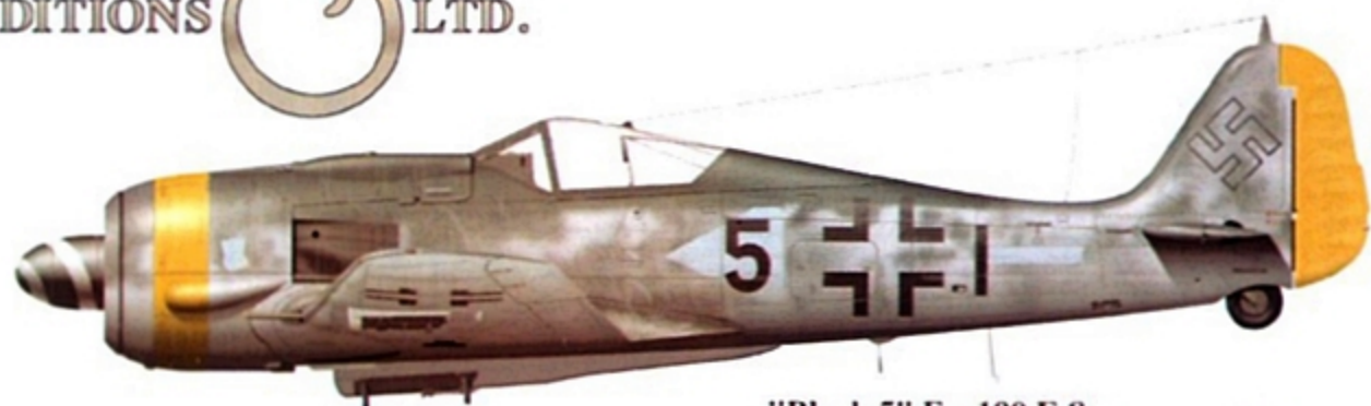
"Black 5" Fw 190 F-8, III. Gruppe, Luftflotte 4 Profile © Tom Tullis