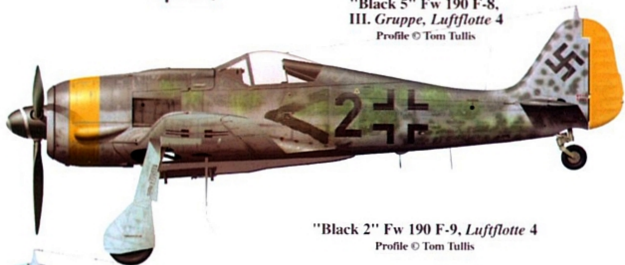
"Black 2" Fw 190 F-9, Luftflotte 4 Profile © Tom Tullis