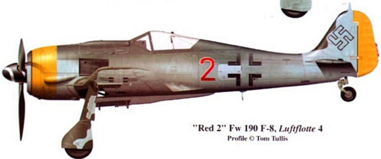
"Red 2" Fw 190 F-8, Luftflotte 4 Profile © Tom Tullis