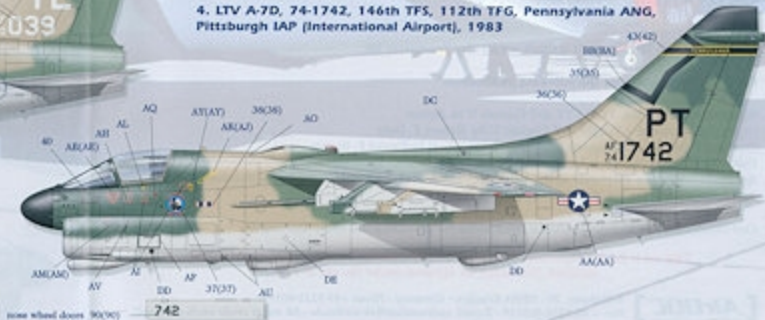
4. LTV A-7D, 74-1742, 146th TFS, 112th TFG, Pennsylvania ANG, Pittsburgh IAP (International Airport), 1983

door applications for aircraft no. 1 - 8