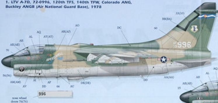
1. LTV A-7D, 72-0996, 120th TFS, 140th TFW, Colorado ANG, Buckley ANGB (Air National Guard Base), 1978