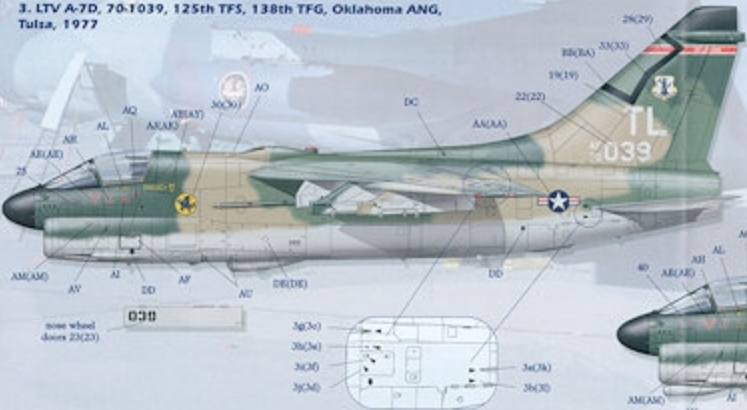
3. LTV A-7D, 70-1039, 125th TFS, 138th TFG, Oklahoma ANG, Tulsa, 1977

door applications for aircraft no. 1 - 8