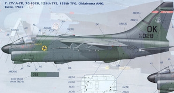
7. LTV A-7D, 70-1028, 125th TFS, 138th TFG, Oklahoma ANG, Tulsa, 1985