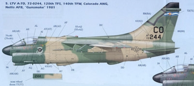
5. LTV A-7D, 72-0244, 120th TFS, 140th TFW, Colorado ANG, Nellis AFB, "Gunsmoke" 1981