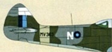
MV363 right side scrap view. Note overpainting of earlier type C roundel in 'fresh' Ocean Grey and also covering and overpainting of camera port in 'fresh' Dark Green.