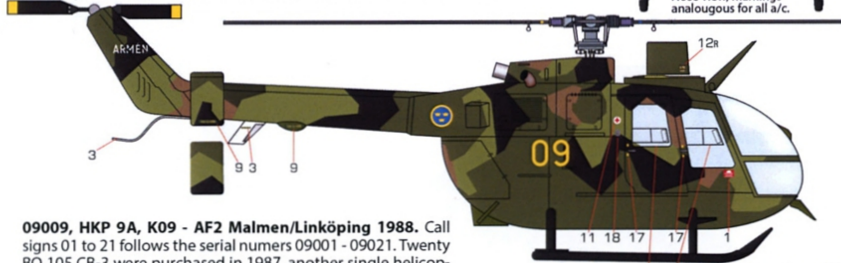
09009, HKP 9A, K09 - AF2 Malmen/Linköping 1988. Call signs 01 to 21 follows the serial numbers 09001 - 09021. Twenty BO 105 CB-3 were purchased in 1987, another single helicopter was later transferred from the Test Establishment, FC.

21R 22R These decals may be applied on the inside (by switching left/right side) prior to assembly.