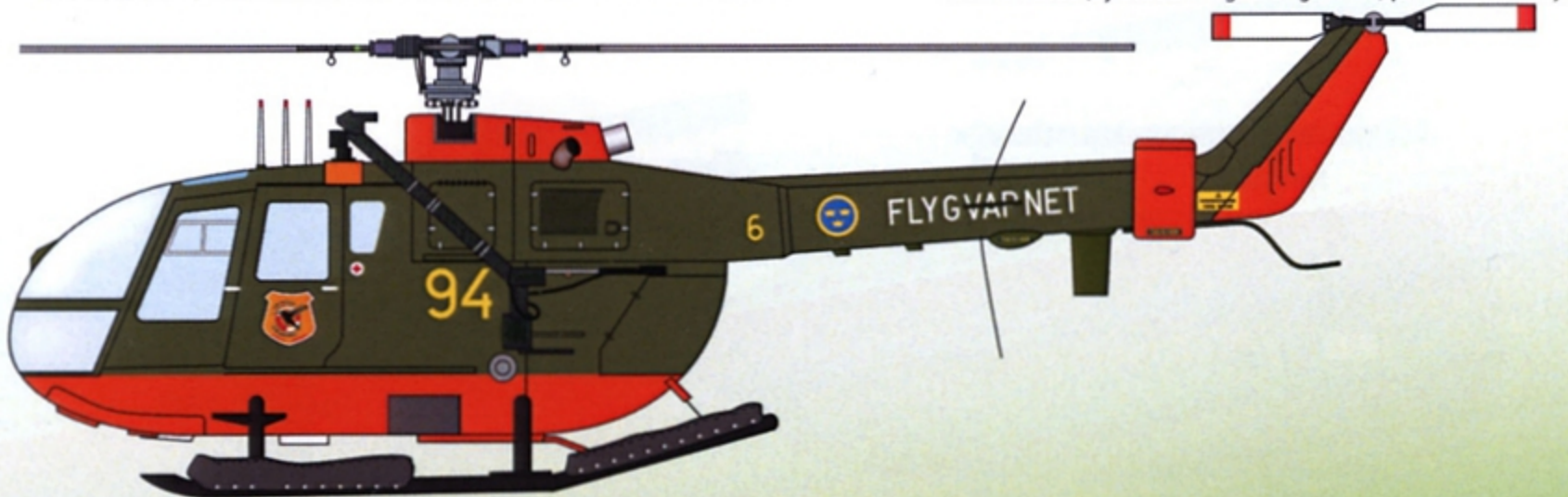
09414, HKP 9B, F94 - F6 Karlsborg. Pressure bottles for the inflatable floats were located on the right lower side of the fuselage. Stencils according to 09009 and 09010. Initially this a/c also had the earlier SAR badge just like 09415.

21R 22R These decals may be applied on the inside (by switching left/right side) prior to assembly.