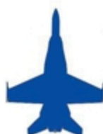
15052 BA BLUE