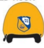
HGU-33P WITH GOLD VISOR

F/A-18B 161711 (FORMER VFC-13. SEE FIGHTERTOWN 48051)