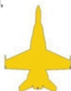
13655 BA YELLOW

ANOTHER CONSIDERATION IS IF YOU ARE PAINTING THE BLUE OVER THE YELLOW, OR LAYING DOWN A COAT OF WHITE FIRST. IF PAINTING DIRECTLY OVER THE YELLOW, BLUE DARKENS UP.