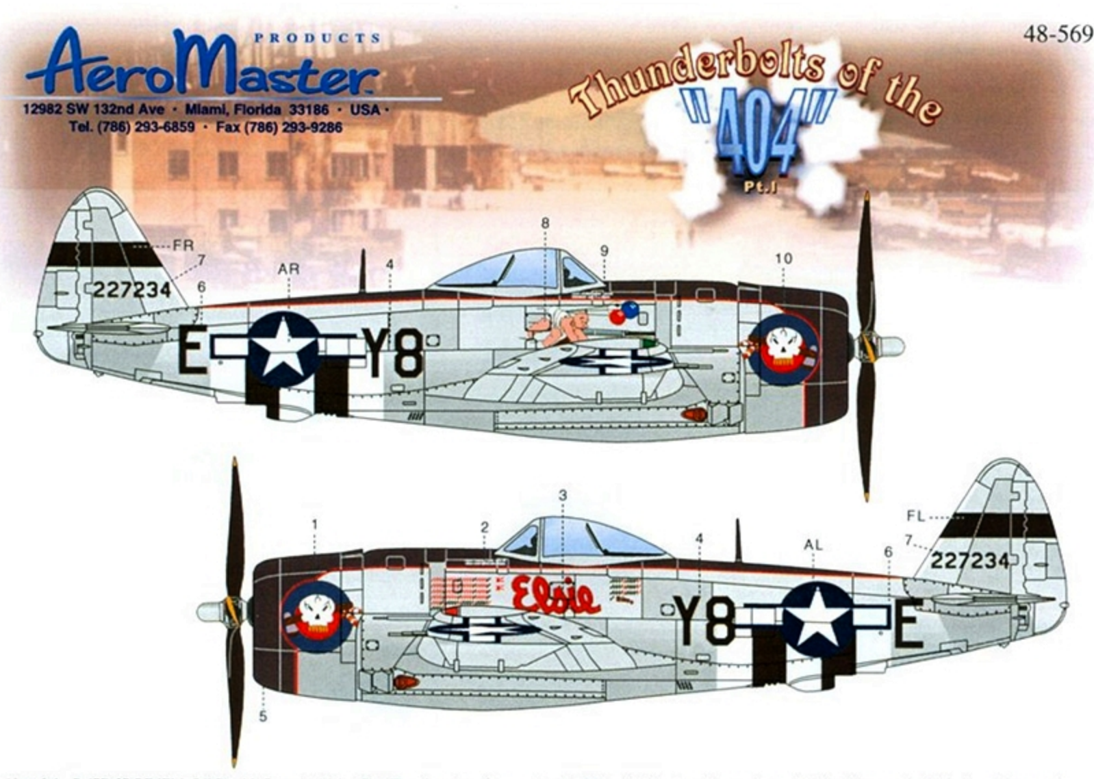
Aircraft 1 - P-47D-27-RE 'Elsie/Lil Butch', flown by Major Clay Tice, Squadron Commander of 507FS, 404FG. Overall natural metal finish with customized Black antiglare panel. Black tail bands. Partial invasion stripes on fuselage. Note oversized and doubled underwing insignias. Use Red decal stripes provided to border antiglare panel. H.S. propeller. No data block on this A/C.