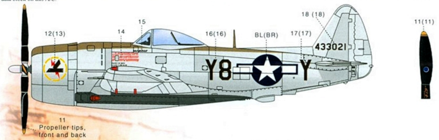
Aircraft 2 - P-47D-30-RA, flown by Lt. William Lee, 507FS, 404FG. This aircraft wears the 1st version of the Thunderbird logo designed by Lt. Lee. It became the group's unofficial insignia near war's end. Aircraft was later named 'Tin Hornet'. Overall natural metal finish with OD antiglare panel. Note Black belly paint to hide exhaust stains. Red bomb racks sway braces.