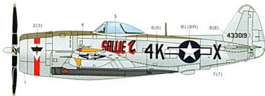
Aircraft 2 - P-47D-30-RA, 'Sallie 2', pilot unknown, 506FS, 404FG. Overall natural metal finish with Olive Drab antiglare panel. Curtiss Electric 13' symmetrical propeller with unpainted prop hub. Black belly paint. Yellow wing tips and forward pylons. Trim decals 2/3 to match painted antiglare panel.