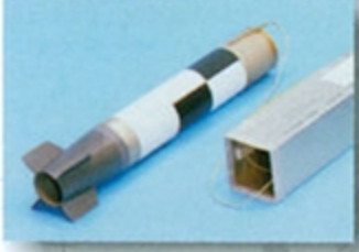
ALE-50 Towed Decoy