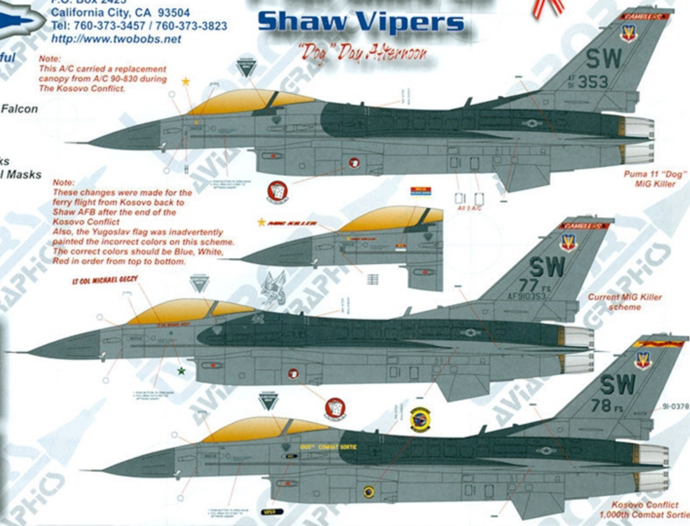
Puma 11 "Dog" MIG Killer

Note: These changes were made for the ferry flight from Kosovo back to Shaw AFB after the end of the Kosovo Conflict Also, the Yugoslav flag was inadvertently painted the incorrect colors on this scheme. The correct colors should be Blue, White, Red in order from top to bottom.