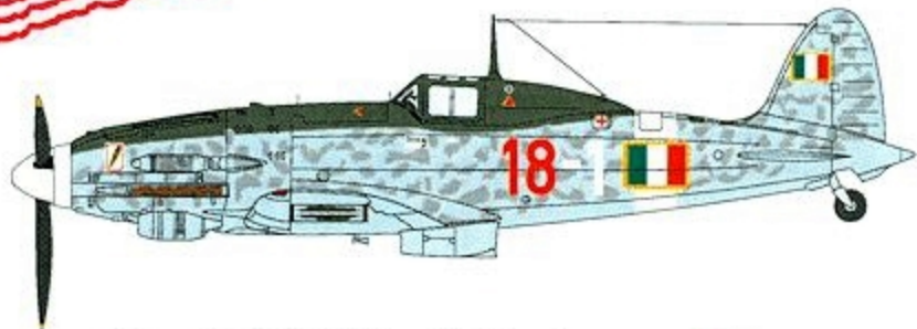
Macchi 205 Veltro Collection