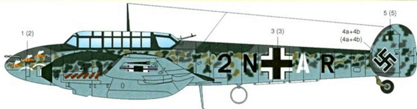
AIRCRAFT 1 • Bf-110 '2N+AR', 7/ZG 76, operating in Norway during the winter of 1941-42. Camouflage is RLM 74 Grüngrau and RLM 75 Grauviolett over RLM 76 Lichtblau undersurfaces. Mottling on fuselage and nacelle sides is RLM 74, 75 and 02Grau. Spinners RLM 70 Schwartzgrün with white tips. Canopy frames RLM 74.