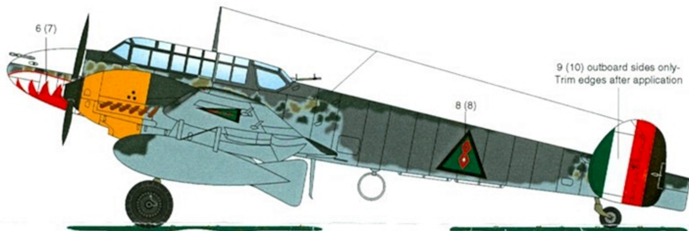
AIRCRAFT 2 • Bf-110D-3, 4/ZG 76, based in Iraq during 1941. Camouflage is RLM 74 and 75 over RLM 76 undersurfaces. Mottling on fuselage and nacelle sides is RLM 74, 75 and 02. Spinners RLM 70 Schwartzgrün with white tips. Note Luftwaffe fuselage codes were oversprayed with a large patch of RLM 75. Note also white upper nose and RLM 04 Gelb cowlings. Use the little red rectangles to patch up the shark mouth, if necessary.