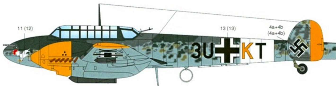
AIRCRAFT 3 • Bf-110D-3, '3U+KT', 9/ZG 26, Northern Africa, 1941. Camouflage is RLM 74 and 75 over RLM 76 undersurfaces. Mottling on fuselage sides is RLM 74, 75 and 02. Spinners, cowlings, undersides of wing tips and rudders RLM 04 Gelb. Canopy frames RLM 74.