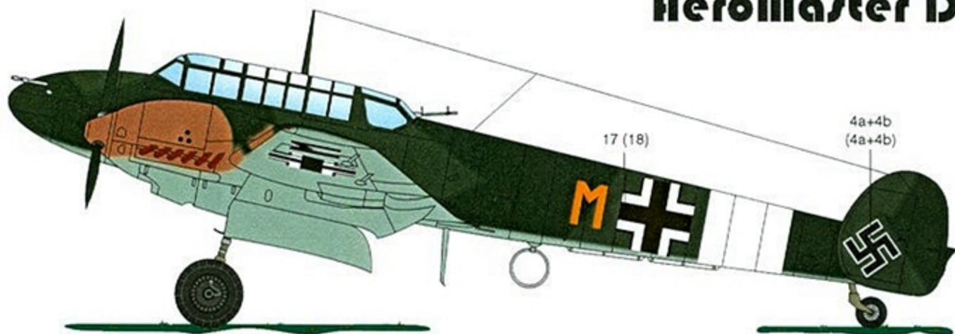
AIRCRAFT 5 • Bf-110C, 'Yellow M', III/ZG 26, North Africa. Camouflage is early scheme of RLM 70 Schwartzgrün and RLM 71 Dunkelgrün over RLM 65 Hellblau undersurfaces. Parts of wings and nacelles oversprayed with RLM 79 Sandgelb (temporary) in a splinter pattern. Note white rear fuselage band. Undersurfaces were possibly oversprayed with the very similar RLM 78 Hellblau.