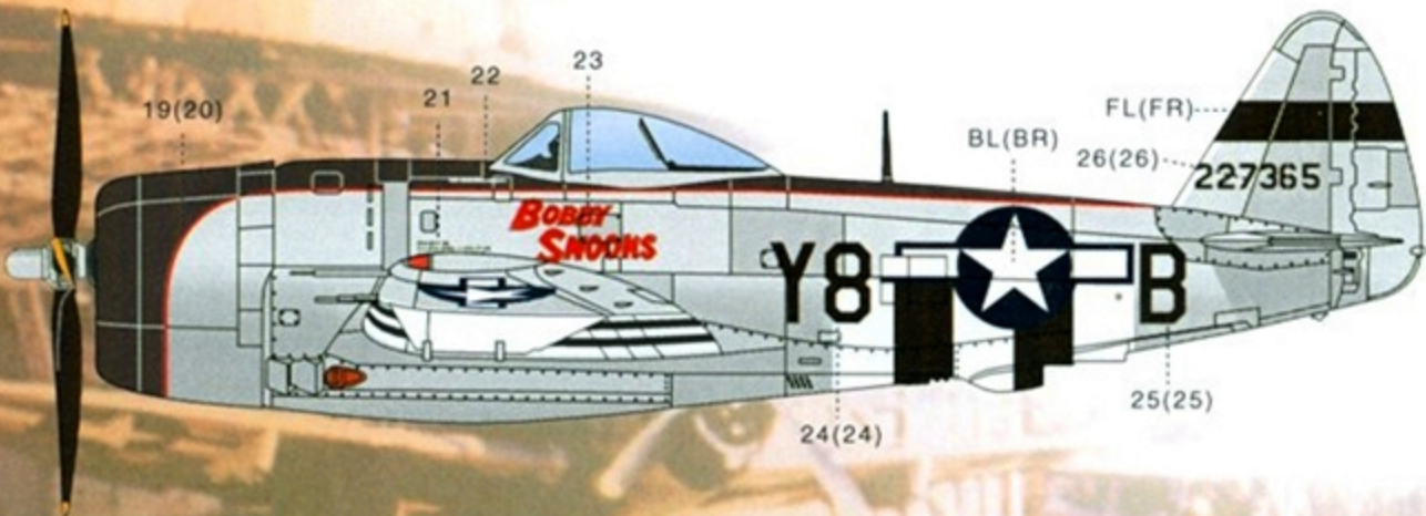
Aircraft 2 - P-47D-27-RE, 'Bobby Snooks', flown by Major Howard Galbreath, 507FS, 404FG. Overall natural metal finish with customized Black antiglare panel. Use Red stripes to continue outline around fuselage antiglare panel. Invasion stripes on undersurfaces of fuselage and wings only. Black tail bands. Spoked wheels.