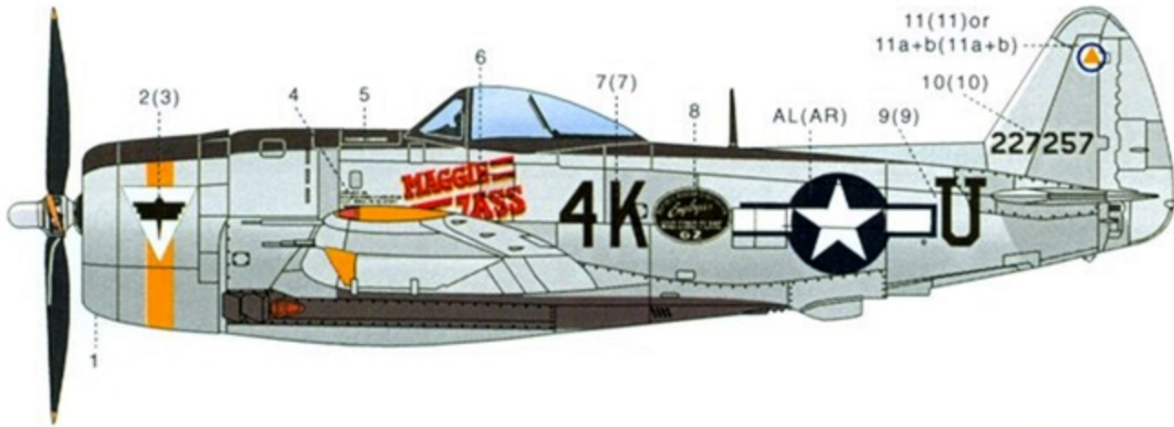
Aircraft 3 - P-47D-27-RE, 'Maggie Zass' flown by Lt. Russell Christopher, 506FS, 404FG. Overall natural metal finish with Black antiglare panel. Wingtips and first section of pylons Yellow. Black belly paint. Hamilton Standard propeller.