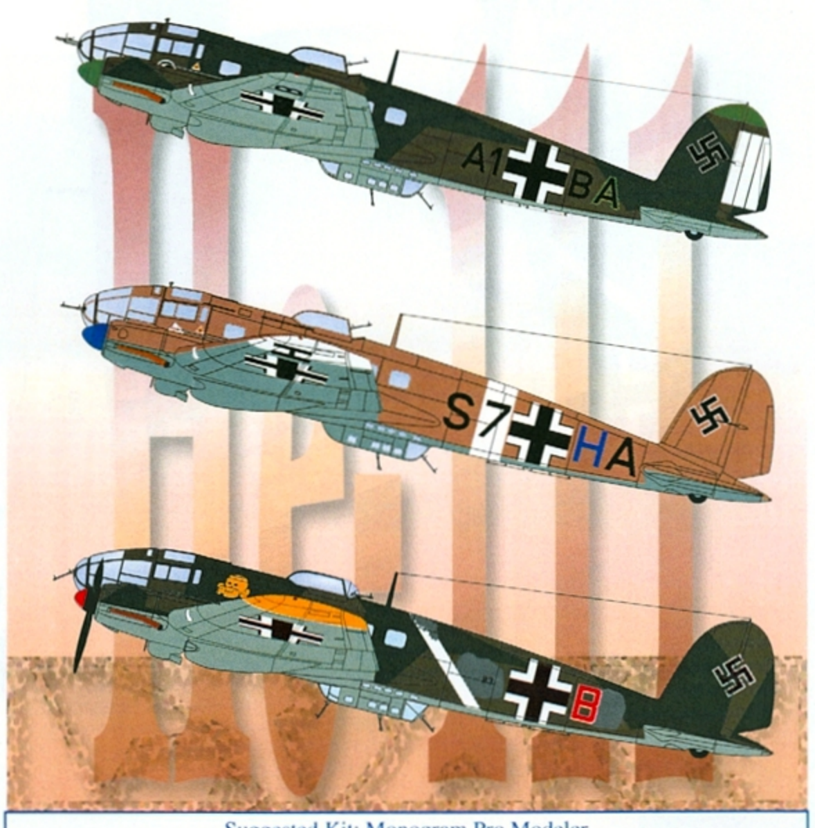
Suggested Kit: Monogram Pro Modeler