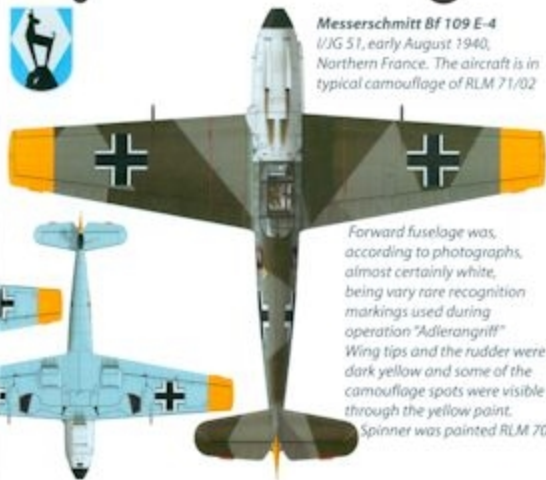
Messerschmitt Bf 109 E-4 I/JG 51, early August 1940, Northern France. The aircraft is in typical camouflage of RLM 71/02

Forward fuselage was, according to photographs, almost certainly white, being very rare recognition markings used during operation "Adlerangriff" Wing tips and the rudder were dark yellow and some of the camouflage spots were visible through the yellow paint. Spinner was painted RLM 70.