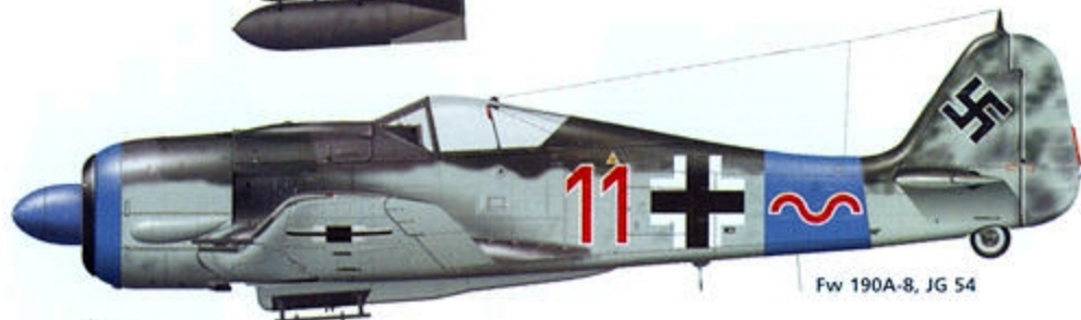
Fw 190A-8, JG 54