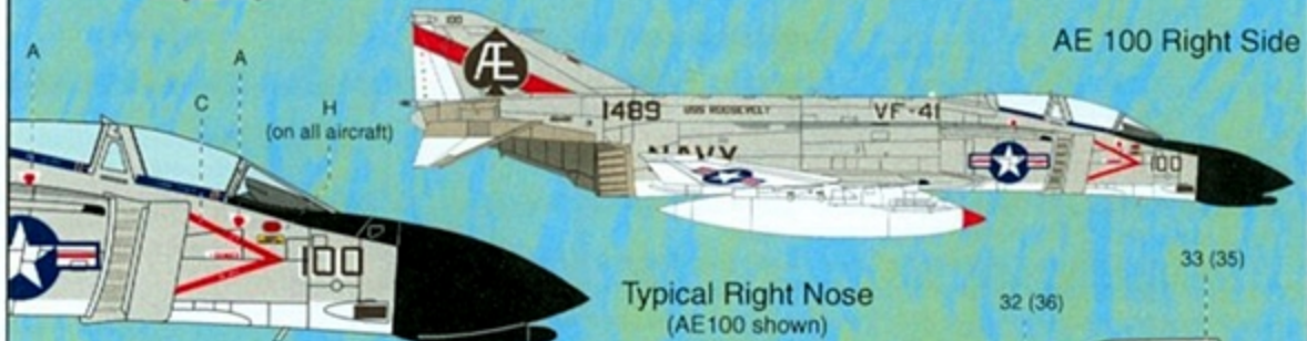
AE 100 Right Side