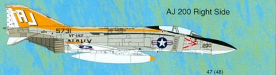
AJ 200 Right Side