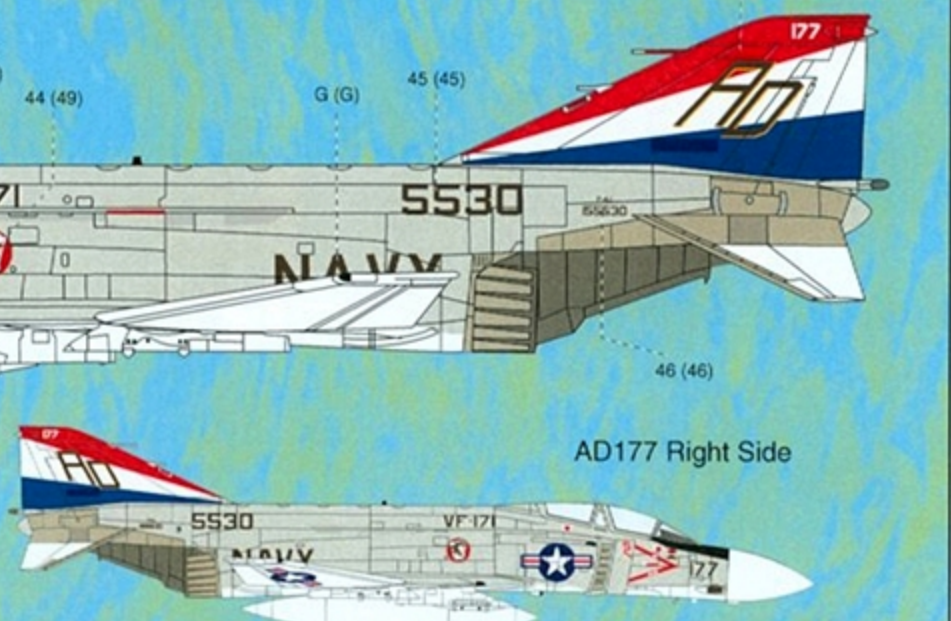
AD177 Right Side