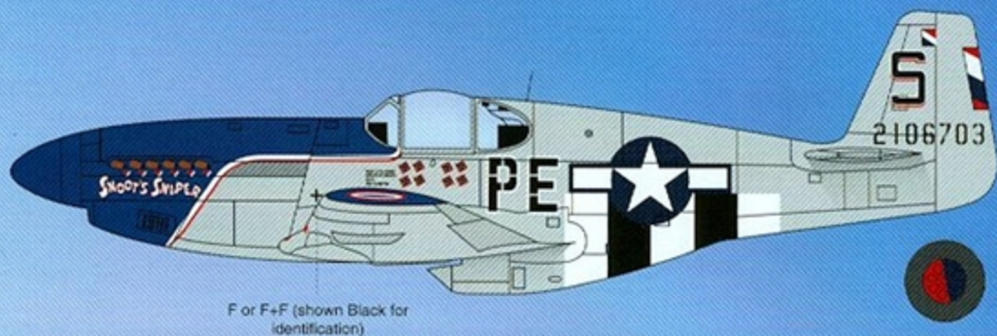
F or F+F (shown Black for identification)

Remarks Only 2 Black lower fuselage bands show on this A/C. Two horn type rear view mirrors on top of the windshield frame, painted a color that looks like the Blue on the nose.