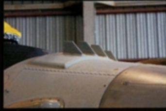
F-16C Block 25 82nd Aerial Targets Squadron Holloman AFB, NM August, 2013