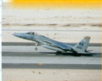
F-15C Eagle S/N 83-0041 57th Wing March 2007