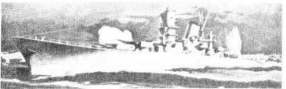
09403 I.M.S. Yamato