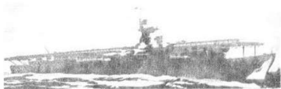
09404 I.M.S. Syokaku