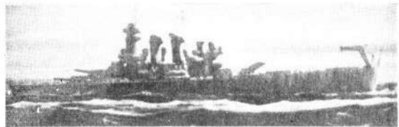
09402 U.S.S. North Carolina