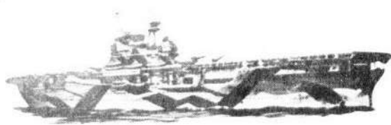
09407 U.S.S. Lexington