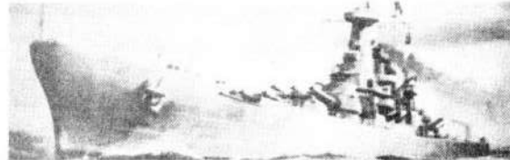
09406 U.S.S. Washington