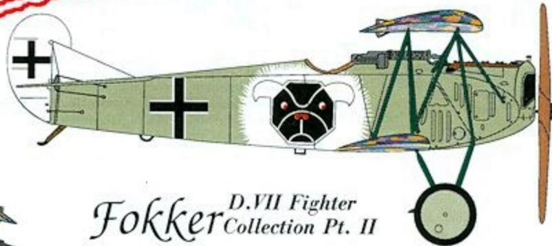
Fokker D.VII Fighter Collection Pt. II