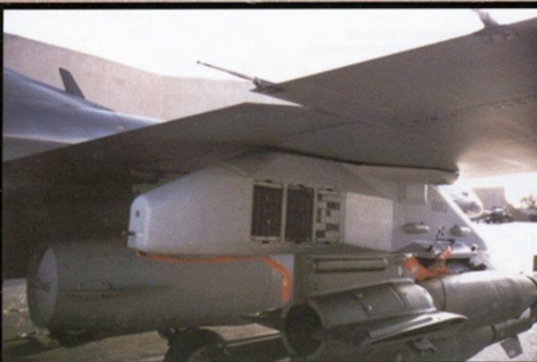
PIDS Pylon mounted on CO ANG A/C 284. Both the COANG and the AL ANG used these pylons during their OIF deployment

Couldn't have done it without you guys!!