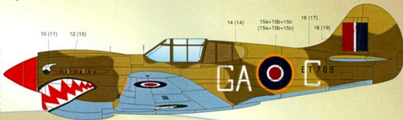
AIRCRAFT 2 • Kittyhawk Mk. III GA•C, serial ET789. No. 112 'Shark' Squadron, RAF. Piloted by Sgt. Hogg, SAAF. Standard desert camouflage of Dark Earth, Midstone and Azure Blue. Notice non standard lower wing roundel. Right side reads C©GA.