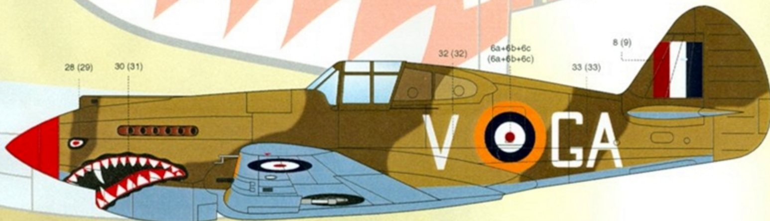
AIRCRAFT 4 • Tomahawk Mk.IIb, V•GA, serial unknown. No. 262 Wing, No. 112 'Shark' Squadron, RAF, Egypt, 1941. Standard desert camouflage of Dark Earth, Midstone and Azure Blue. Right side reads V©GA.