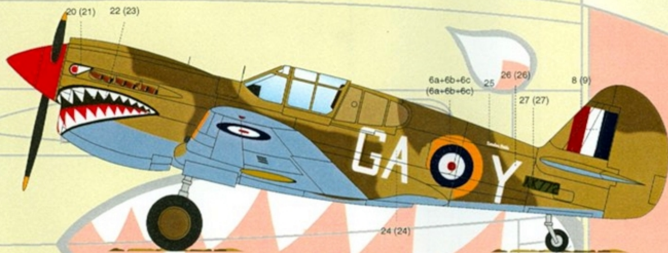
AIRCRAFT 3 • Kittyhawk Mk. 1a "London Pride", GA•Y, serial AK772. No.112 'Shark' Squadron, RAF, Gambut, 1942. RAF Dark Earth and Midstone uppersurfaces, Azure Blue undersides. Note crude overpainting around fuselage roundel. Right side reads Y©GA.