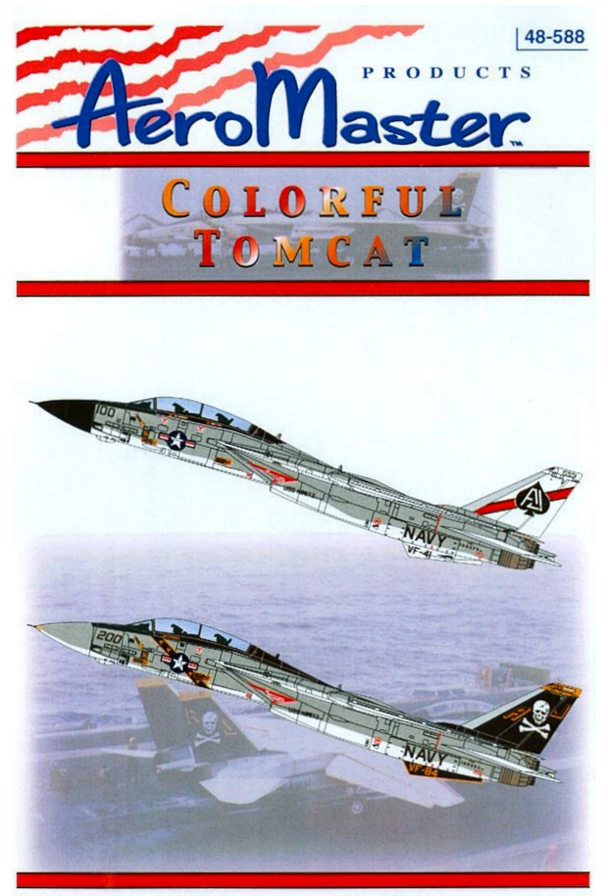
Suggested Kit: Hasegawa F14A Family