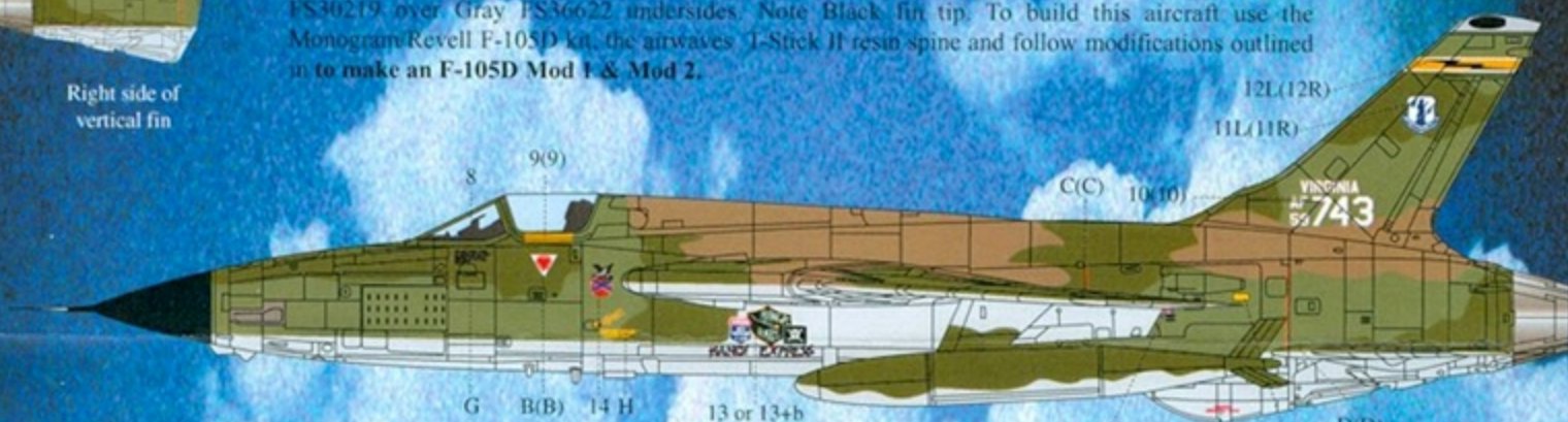
F-105D Thunderchief 59-1743, 'Hanoi Express' of 149th TFS Virginia ANG, circa 1970's.

Standard US SEA camouflage scheme of Dark Green FS34079, Medium Green FS34102, Tan FS30219 over Gray FS36622 undersides. Note Black fin tip. To build this aircraft use the Monogram/Revell F-105D kit, the airwaves J-Stick II resin spine and follow modifications outlined in to make an F-105D Mod 1 & Mod 2.