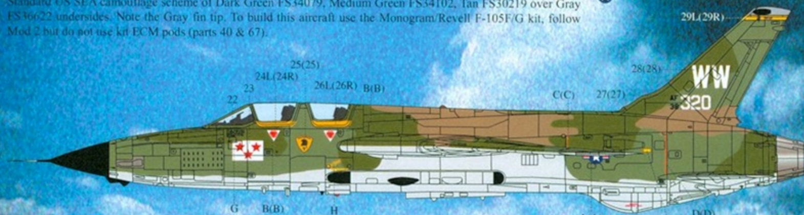
F-105G (Early) Thunderchief 63-8320 of 561st TFS/388th TFW, Thailand, 1973.

Standard US SEA camouflage scheme of Dark Green FS34079, Medium Green FS34102, Tan FS30219 over Gray FS36622 undersides. Note the Gray fin tip. To build this aircraft use the Monogram/Revell F-105F/G kit, follow Mod 2 but do not use kit ECM pods (parts 40 & 67).