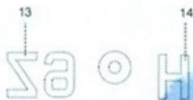
Starboard side positioning of codes and roundel