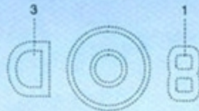
Starboard side positioning of codes and roundel