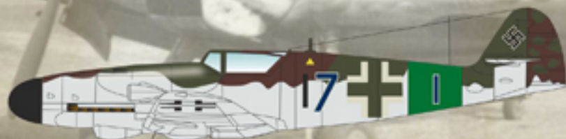
11 Bf 109 k-4 part: 12.III/JG 27 number: 7+I Prague, may, 1945.