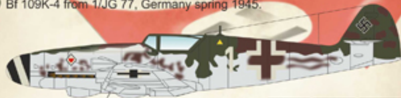
5 Bf 109K-4 from 1/JG 77, Germany spring 1945.