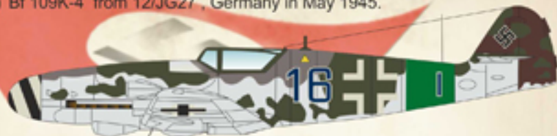
8 Bf 109K-4 from 12/JG27, Germany in May 1945.