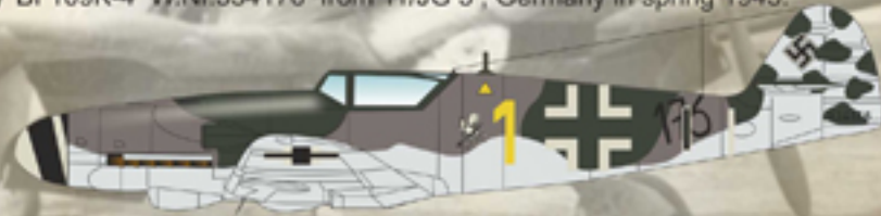
7 Bf 109K-4 W.Nr.334176 from 11/JG 3, Germany in spring 1945.