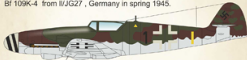
9 Bf 109K-4 from III/JG27, Germany in spring 1945.