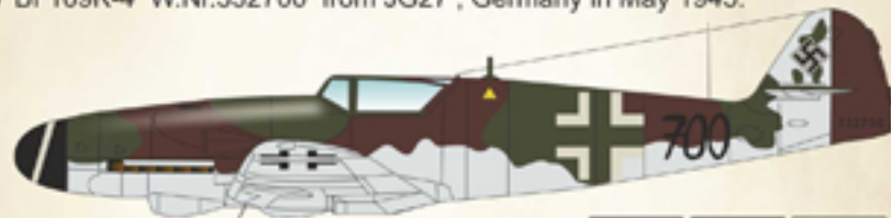
6 Bf 109K-4 W.Nr.332700 from JG27, Germany in May 1945.