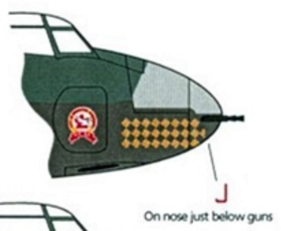
Mosquito FB.VI 'City of Edmonton' HX819