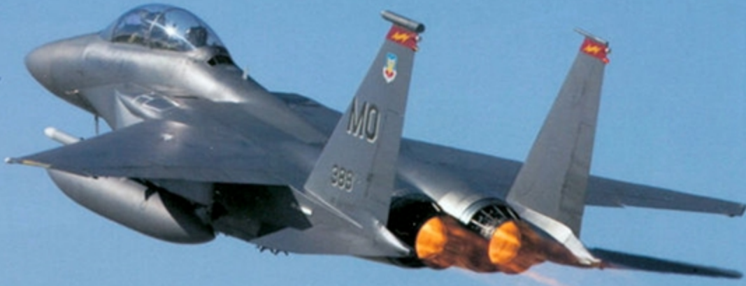
The 389th Fighter Squadron Commanders jet, A/C 88-1705, lifts off in the morning sun for a sortie from Nellis AFB, NV during a recent Red Flag.