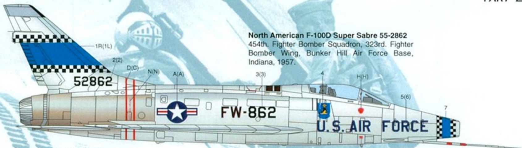
North American F-100D Super Sabre 55-2862 454th. Fighter Bomber Squadron, 323rd. Fighter Bomber Wing, Bunker Hill Air Force Base, Indiana, 1957.