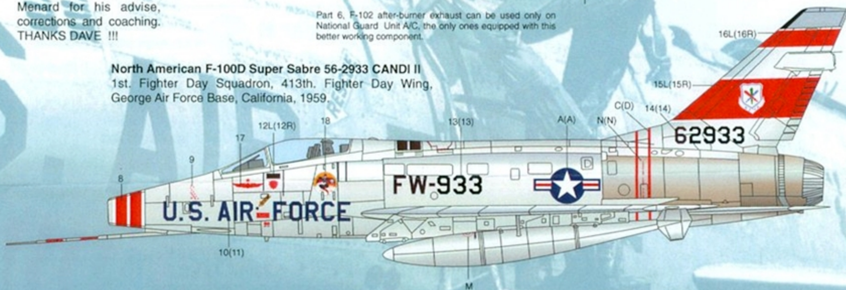
North American F-100D Super Sabre 56-2933 CANDI II 1st. Fighter Day Squadron, 413th. Fighter Day Wing, George Air Force Base, California, 1959.

Recommended Kit 1:48 Monogram/Revell F-100D Super Sabre