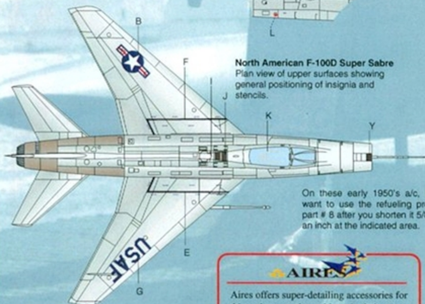
North American F-100D Super Sabre Plan view of upper surfaces showing general positioning of insignia and stencils.

Recommended Reference F100 Super Sabre in Color, Robert Robinson & David Menard, Fighting Colors, Squadron/Signal Publications North American F-100 Super Sabre, famous Airplanes of the World No. 22, Bunrin-Do Co. Ltd. USAF Europe 1948-1965 in Color, Robert Robinson, Fighting Colors, Squadron/Signal Publications